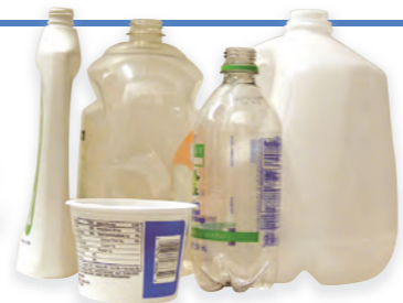
narrow-neck plastic bottles and jugs (#1-7) and wide-mouth containers