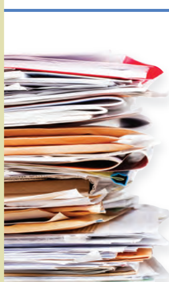
office paper and mail