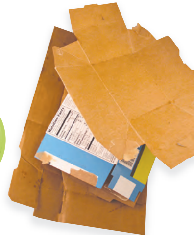
cardboard and paperboard boxes Flatten to fit into cart.

Pack into a paper bag and securely tape it closed.