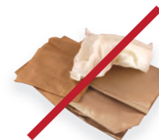
paper towels or napkins