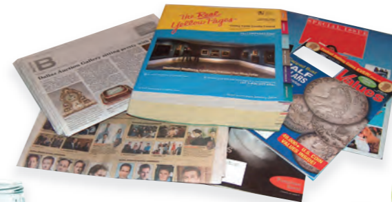
newspaper and magazines