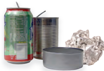
aluminum, steel, tin cans and foil