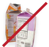
waxed paper containers